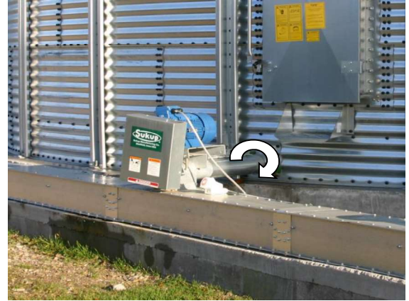
SWEEPWAY (DK) Vandret tømmesystem - (UK) Horizontal unloading system - (DE) Horizontale Entladesystem.