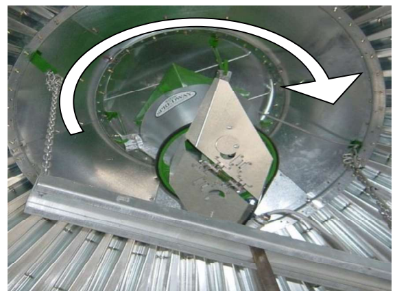
SPEADWAY (DK) Kornspredner - (UK) Grain Spread way (Grain Spreader) - (DE) Korntreuer