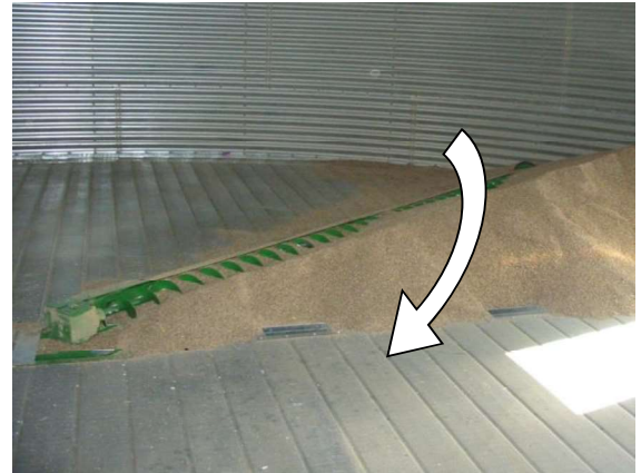
SWEEPWAY (DK) Fejesnegl - (UK) Sweep Auger - (DE) Sweep-Schnecke