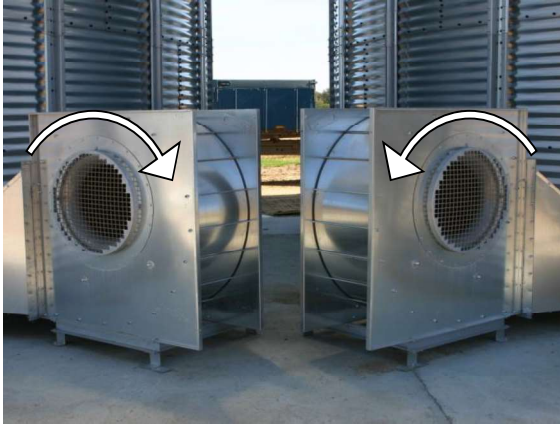
(DK) Blæsere - (UK) Blowers - (DE) Gebläsen.